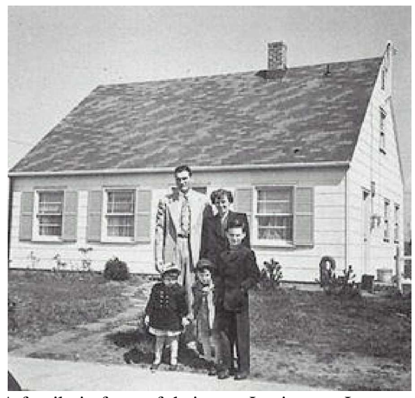
A family in front of their new Levittown, Long Island home.

1. Examine the pictures below, read the excerpts from newspaper articles and gather more information from the internet before reaching your conclusions. To learn more about the history of Levittown, New York and similar Levitt housing developments in New Jersey and Pennsylvania visit: people/b&t/william.htm; www.scc.rutgers.edu/njh/MassConsumerism/ Suburb/Race.htm; www.infoclub.com.np/lifestyle/; www.time.com/time/time100/builder/profile/levitt3.html; tigger.uic.edu/~pbhales/Levittown.html; www.lihistory.com/specsec/levmain.htm; and www.nreionline.com/ar/real_estate_postwar_america_hitches. 2. After examining all of the sources, use the documents and information from the internet to answer the question: Levittown, New York: Triumph of post-World War II American society or symbol of racial injustice? Your essay should have a clear introduction that states your opinion, at least three paragraphs that present supporting evidence, and a summary concluding paragraph that summarizes your ideas. It should be approximately 500 words long.